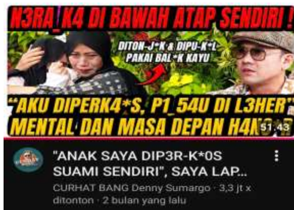
Figure 1. Episodes Addressing Selected Social Issues

The findings of this study were obtained through the collection of primary data in the form of in-depth interviews with informants who are listeners of Denny Sumargo's podcast, as well as secondary data in the form of observations of the podcast content and listener comments on episodes addressing social issues, specifically the episode titled "MY CHILD WAS R@PED BY MY OWN HUSBAND," "I REPORTED IT TO THE POLICE BUT WAS TOLD TO STAY WITH THE PERPETRATOR!!".