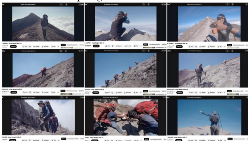
Figure 2. Atap Negeri Content on Body Language

These body motions graphically communicate ideas about tenacity, adversity, and cooperation. Clenching one fist, gripping a fellow hikers hand, and spending time by yourself are all examples of gestures that strengthen the sense of community and introspection that develops along the way. Examples of these gestures and body movements can be seen in Figure 2, which illustrates the role of body movements as a medium of nonverbal communication in the Atap Negeri content.