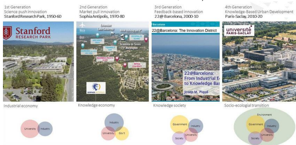
Figure 3. Famous technoparks of the world